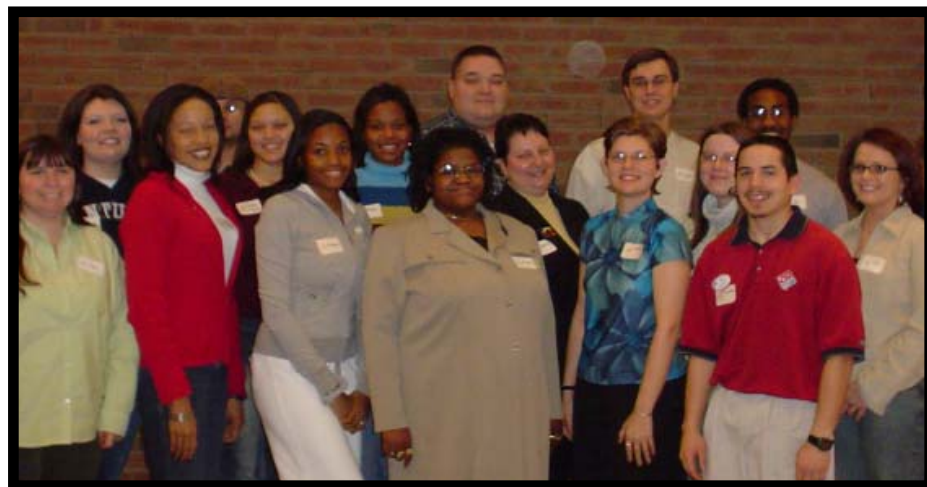
2004 McNair Scholars

The primary focus of the McNair Scholars Program is to provide academic experiences for participants that will help ensure their successful baccalaureate degree attainment. In addition, their participation in scholarly activities, mentoring and research activities will help prepare them to enter and experience success in a select graduate program.